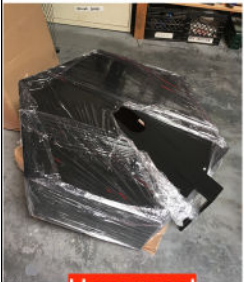
Hexagonal Wood Base

Plugs at bottom - Circuits 1 and 2 = outlets at top Circuit 3 = lamp post bulb