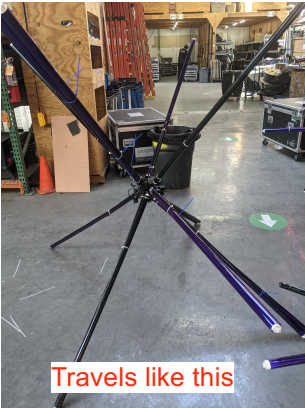
Travels like this

4' urchins (made with 2' LED tubes, 140w total) come fully assembled