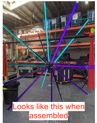
Looks like this when assembled

8' urchins (made with 4' LED tubes, 280w total) will travel with 4 legs unattached and zip tied to other legs