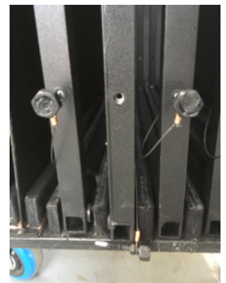
Bolts will need to be returned on strike so the door can close