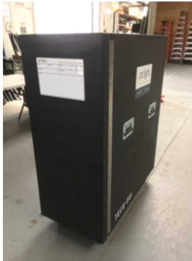
The case it rides in