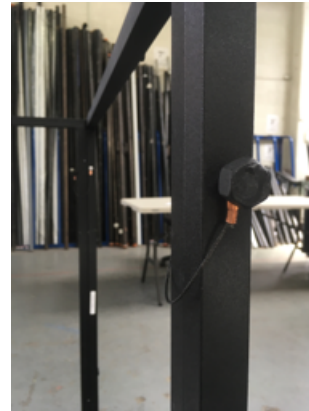
Remove the next bolts and add panel 2