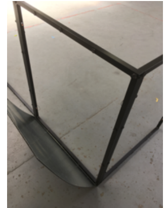
Line up your sheet on the bottom and lift into place