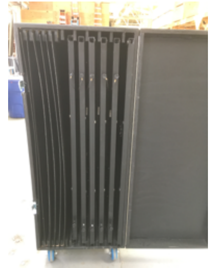
Panel sheets in the thinner slots on the left and panel frames on the right.