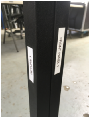
Return 1 and panel 1 will always be the start