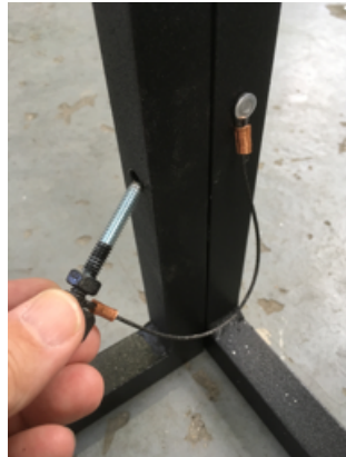
Easy through bolt assembly